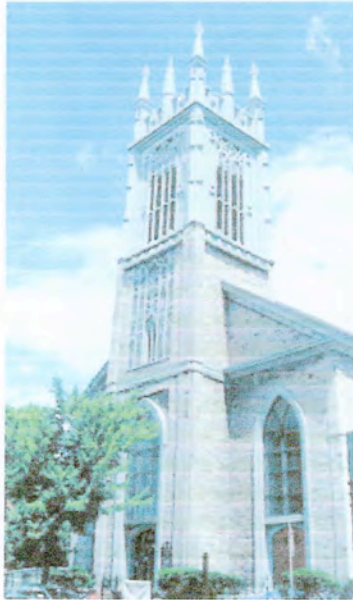
St Paul's Church, Troy NY

St. Paul's Episcopal Church in Troy, New York, is known both for its music and for its Tiffany stained glass windows. This is the story of one of St Paul's most beautiful Tiffany windows.